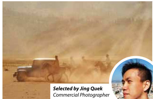
Selected by Jing Quek Commercial Photographer