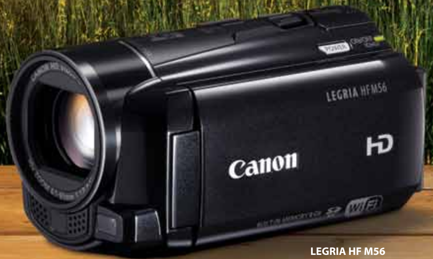
LEGRIA HF M56

Write out your ideas, expand on them, plan for the shoot, diligently cast your actors. All these add up to a fine production later on.