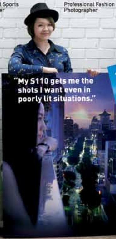
Shavonne Wong Professional Fashion Photographer