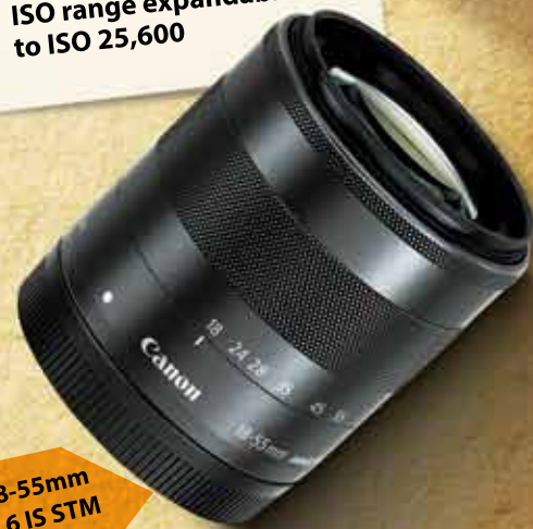
EF-M 18-55mm f/3.5-5.6 IS STM zoom