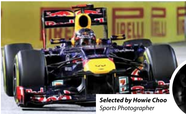
Selected by Howie Choo Sports Photographer