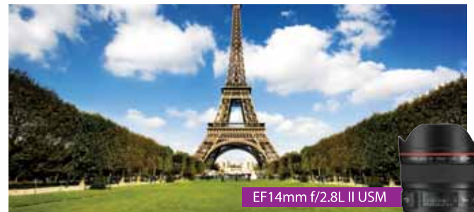
EF14mm f/2.8L II USM

Wide-angle lenses offer a sweeping perspective and are popular for capturing landscapes. Because of the greater angle of view, they also offer greater depth of field.