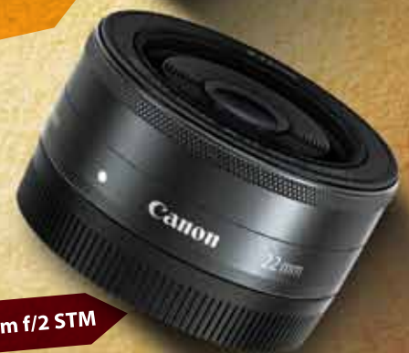
EF-M 22mm f/2 STM