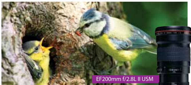
EF200mm f/2.8L II USM

Telephoto lenses have longer focal lengths that offer users a closer view of subjects at a distance. The angle of view is also narrower. With shallower depth of view, telephoto lenses are excellent for isolating interesting details or reaching distant ones.