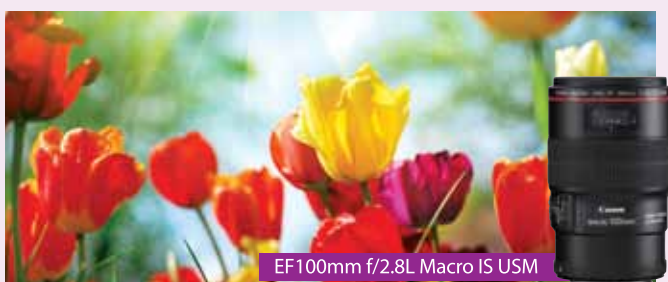
EF100mm f/2.8L Macro IS USM

Macro lenses allow users to capture minute details and subjects such as insects, flowers and areas that the human eye would normally miss. Tilt-shift lenses were originally designed to offer perspective control in architectural photography but have become increasingly popular for capturing interesting imagery through the creative use of selective focus.