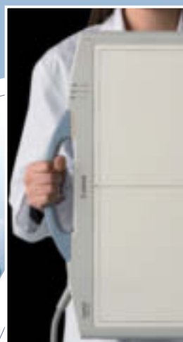
Easy-carry ergonomic design, weighs just 10.6 lb. (4.8 kg).

Less than an inch thick (23 mm) and weighing only 10.6 lb. (4.8 kg), the compact CXDI-50C can be flexibly used in diverse applications, including trauma, ICU, and bedside exams. It's portable, lightweight, and easy to position—even the patient can comfortably hold the unit in place during image capture, if necessary.