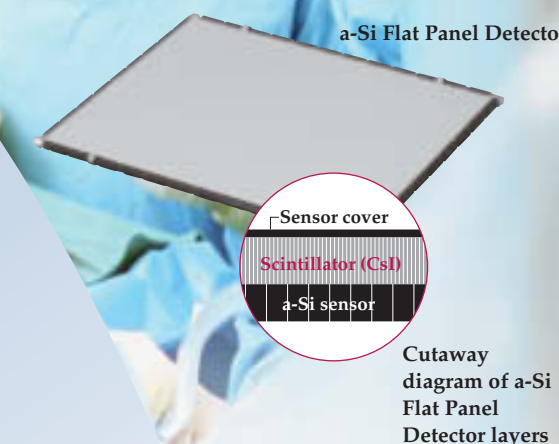
Cutaway diagram of a-Si Flat Panel Detector layers

Featuring Canon's advanced LANMIT 7 detector technology, the CXDI-50C efficiently delivers high-quality diagnostic images with minimal X-ray exposure to patients, making it ideal for pediatric and orthopedic use. The Amorphous Silicon Flat Panel Detector of the CXDI-50C is coated with a scintillator made of an array of tiny Cesium Iodide (CsI) crystals, which offers the dual benefits of more effective X-ray absorption and higher signal-to-noise performance compared with conventional systems.