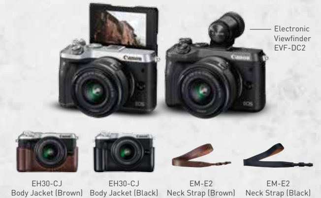
EH30-CJ Body Jacket (Brown) EH30-CJ Body Jacket (Black) EM-E2 Neck Strap (Brown) EM-E2 Neck Strap (Black) Electronic Viewfinder EVF-DC2

For even more creative opportunities, choose from 3 selectable shooting intervals to shoot your favourite time-lapse videos.